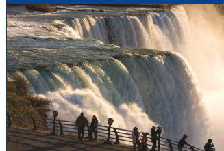
World's most famous Falls

Day 7: Today after enjoying a Continental Breakfast, you depart for home... a time to chat with your friends about all the fun things you've done, the great sights you've seen and where your next group trip will take you!