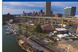
Visit to Buffalo's Canalside