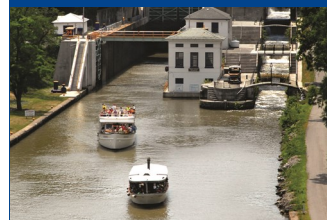
Enjoy a Cruise along the Erie Canal